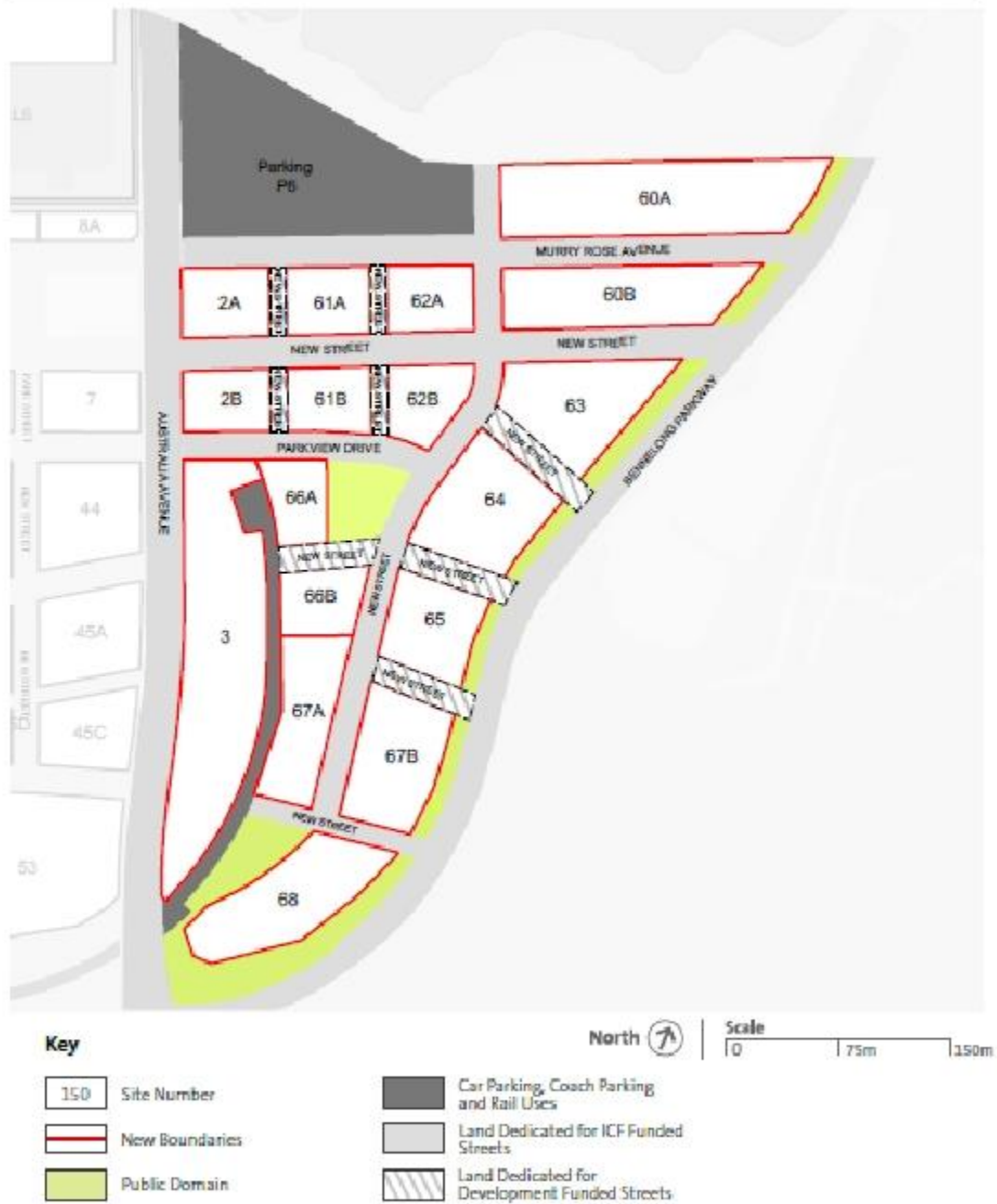
Figure 5.38 Parkview Precinct Site Boundaries Plan